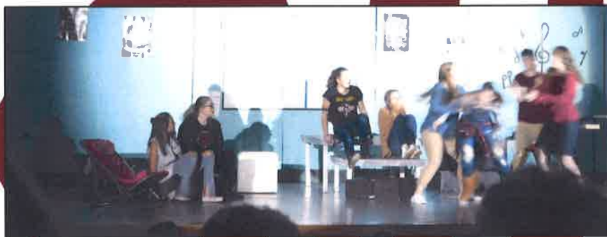
Above Right -One Act Team takes 4 th Place at State!