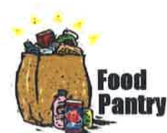
Table of Grace Mobile Food Pantry