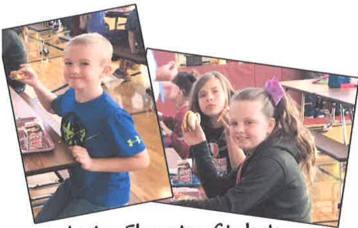
Leyton Elementary Students enjoying locally raised beef for lunch!

Leyton Public Schools is proud to participate in the "Nebraska Beef in Schools" lunch program!