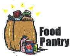
Table of Grace Mobile Food Pantry